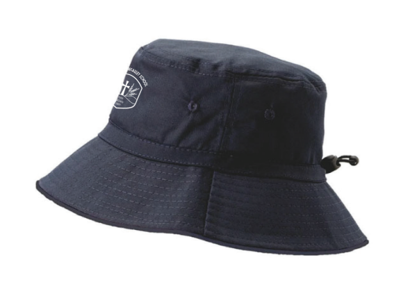
To place an order scan the QR code.