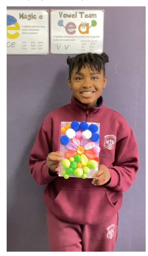
PARENT TEACHER INTERVIEWS – 3 Way Interviews

Parent/Teacher Interviews- 3 Way Learning Conversations, are a formal opportunity to meet with teachers and they are coming up in week 9, this term.